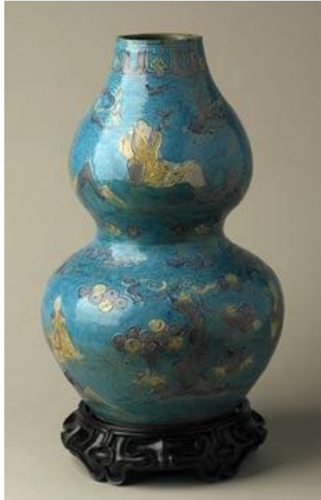
Fig.12. Fahua vase of double gourd shape (LL 6067).

Sparks had a Commission for it so we should not have got it ... we were lucky to get anything at all at our prices. 45 Lever spent £1,351. 7s. 0d in total.