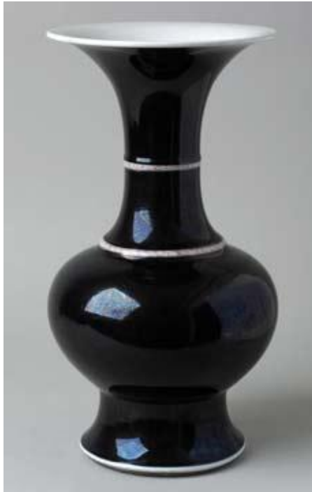
Fig.13. Black mirror vase (LL 6495).

Nine months after the Kennedy sale, Sparks thought that Lever might still be interested in buying one of the Ming figures and made an attempt: 'Kennedy gave the sum of £850 for the figure, but I am now able to offer you £700. Should this piece not interest you, may I ask you to be so kind as to allow one of your secretaries to send me back the coloured illustration.' 47 On 12 March Lever replied, 'I do not think it is likely to be of interest to me, therefore, do not miss a sale to anyone else by considering it is under offer to me.' 48 However, on the same day Lever also inquired of Partridge: 'Do you know anything about the figure?' 49 A more competitive dynamic was presented in Partridge's response: 'I was prepared to give £400 for it. There has been some restoration done to the head and I think the head has been off, but this could be gone into if you entertain it. I am in favour of purchasing this if it can be got at a reasonable price, as it is a very fine figure and brilliant in colour.' 50 He added: 'I often wondered where this figure had gone as Christie's deliberately told me it was sold, and it looks as though it was run up and bought in.' 51 This incident suggests that the balance of negotiating power had now shifted. Partridge acted as a powerful dealer who was able to blacklist Sparks who 'threatened' him in the china market. A year later S. E. Kennedy's second sale was held on 21 March 1918: Lever obviously put his trust in Partridge. 52