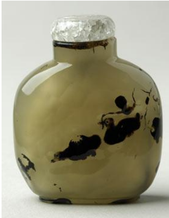
Fig.16. Example of a snuff bottle from the Lever collection (LL 9323).

On 18 December 1922 Partridge was invited to the opening of the Lady Lever Art Gallery at Port Sunlight. The Museum was dedicated to the memory of Lever's wife Lady Elizabeth Ellen Lever who died in 1913. Partridge expressed his admiration for what Lever had achieved. He wrote, 'I must confess a touch of pride came to me at having had a good share in collecting some of them. ... most impressive sights are the Sculpture Halls and the Oriental Porcelain, which I thought looked lovely.' 61 Lever replied, 'I am sorry I did not see you there, but it was all such an exciting time and so rushed that it was impossible. I enclose you copy of the speech from a Liverpool paper.' 62 During the opening, Partridge was very sociable with Lever's guests; the next day he wrote, 'The Queen has asked me to help her in placing important pieces of furniture illustration in Mr. McQuoid's Book. ... Your Lordship must have several of these pieces, and if you could give me a list of them.' 63