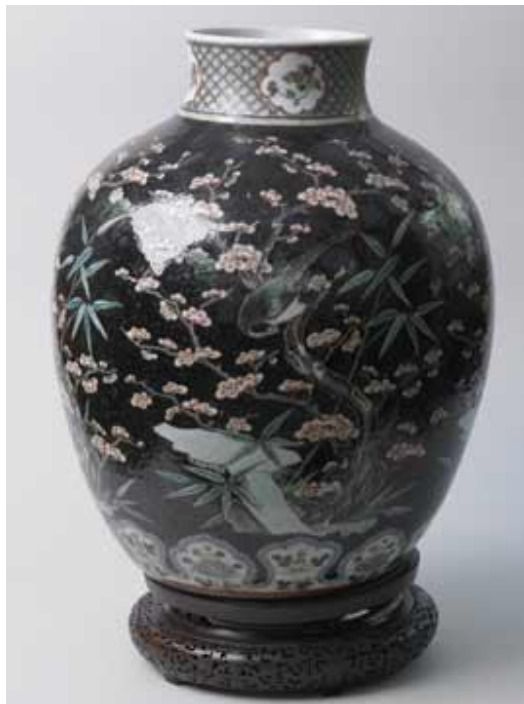
Fig 6. Large oviform vase of red hawthorn (LL6731)

to get him some Black Chinese porcelain and if you have any that you are willing to dispose of I can get you good prices.’ 16 The following day Lever wryly replied, ‘... I should not be willing to dispose of my black Chinese vases except at such extreme prices as I feel confident would make you unwilling to entertain the purchase.’ 17 Partridge thought that he was smart enough to negotiate, ‘I have been up to see your Black Vases and I shall be much obliged if you will let me know your lowest price for the 5.’ 18 Lever showed his position as a serious collector of Chinese porcelain and wrote, ‘... I am not anxious to sell the Vases. It is not possible for me to put them on offer’. He suggested, ‘If, however, you like to make an offer you are at liberty to do so. I may say, however, that there are six Black Vases you evidently did not see the Large Oviform Vase of Red Hawthorn (Fig.6: LL 6731) in the China Corridor.’ 19