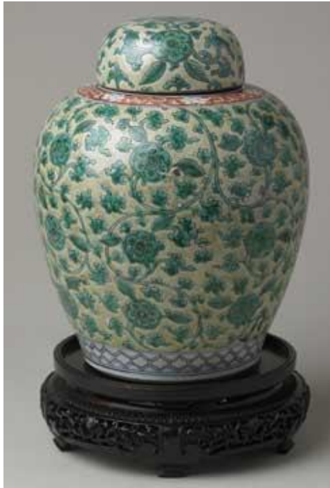
Fig 7. Kangxi oviform jar (LL6750)