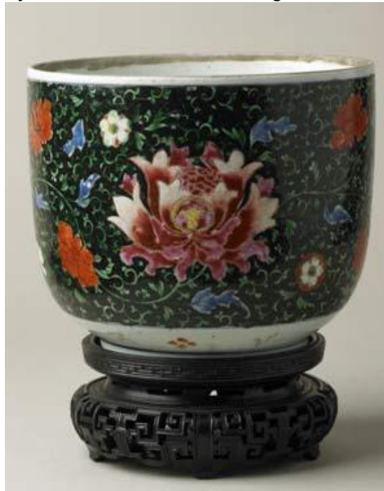
Fig.9. A deep bowl (LL 6734).

auction sale of 'A Lady of Title's' collection on 14 March 1916, where Partridge purchased Chinese crystal and hardstone carvings for Lever. 33