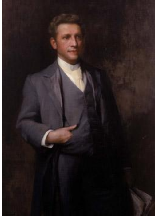
Fig.3. Portrait of William Hesketh Lever (1897), by Samuel Luke Fildes (1843-1927). Mr. William Lever is shown as a prosperous and confident business man. (LL 3114)

The next morning, Lever came back at the promised time. As a forthright man, he came straight to the point: 'I will not become your sleeping partner. If I join you, it would discredit you with your other customers. Once they discover that I am behind you they would assume I was taking the first choice of all you have, and so lose interest in coming to you.' 14