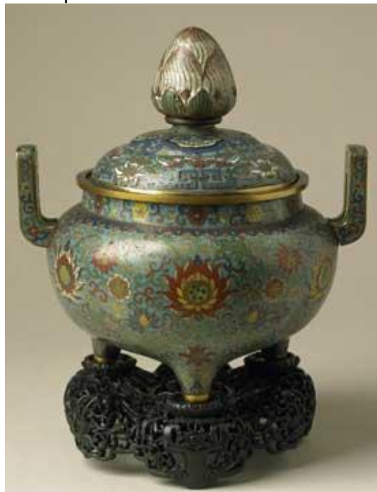
Fig.11. Cloisonné incense burner with Qianlong mark (LL 5916).