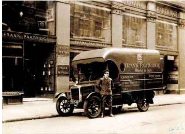
Fig.4. A view of Frank Partridge's shop in 26 King Street taken on 14 Feb.1928.

Partridge learnt a lesson from this man who, in his 40s, was worth millions, but who had started as a grocer's assistant with nothing in his pocket. As a result of the success and expansion of the new business, Partridge was eventually able to move to 26 King Street in 1912 (Fig.4 and Fig.5).