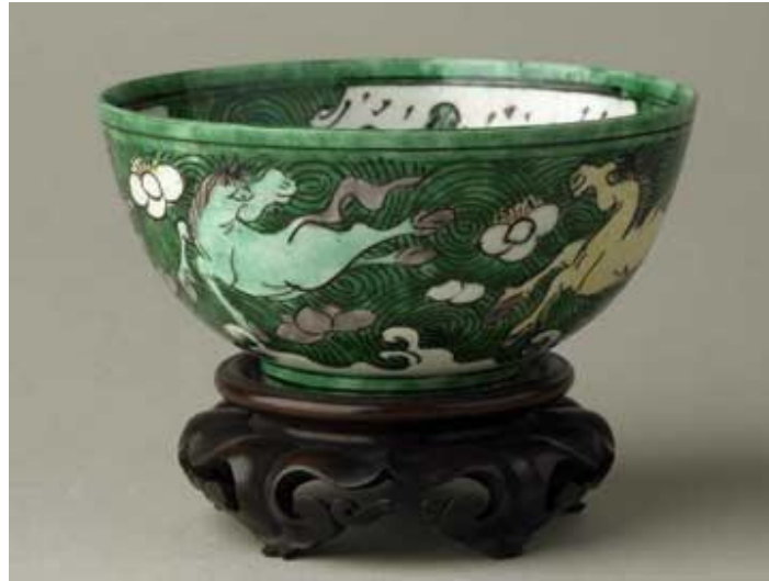
Fig.14. Famille verte bowl (LL 6670).

In their letters Lever and Partridge often discussed the transformation of aesthetic value into economic value and Partridge included marked lists of interesting lots for Lever. On 24 June 1918 he sent two catalogues of snuff bottles to Lever and suggested, 'If you can spare £500 - I believe we can get nearly all the best ones.' 53 Lever was smart enough to reply, 'I think if I go up to £300 ... it will be a good start. I have generally done better when I have started slowly. If, however, the prices were extremely low, then I would leave it to your discretion.' 54 Partridge reported to Lever that he had a most successful day and bought 155 pieces which cost £445. 15s. 0d. Partridge additionally commented on their value: 'They are average about £2. 10. 0d per piece, which is exceedingly cheap. If you cannot afford to take the lot I am quite willing to keep half of them myself. I do not think such an opportunity will come along again, and as they were going so cheaply I took the opportunity of making a nice collection. They will cause you lots of pleasure when you have time to go into them.' 55 Part of the pleasure of collecting lies in competition, and the successful acquisition provides full customer satisfaction. Lever immediately replied, 'I enclose cheque £490. 6. 6 being the amount of the price paid at auction, plus 10%.' 56 (Fig.16: LL 9323)