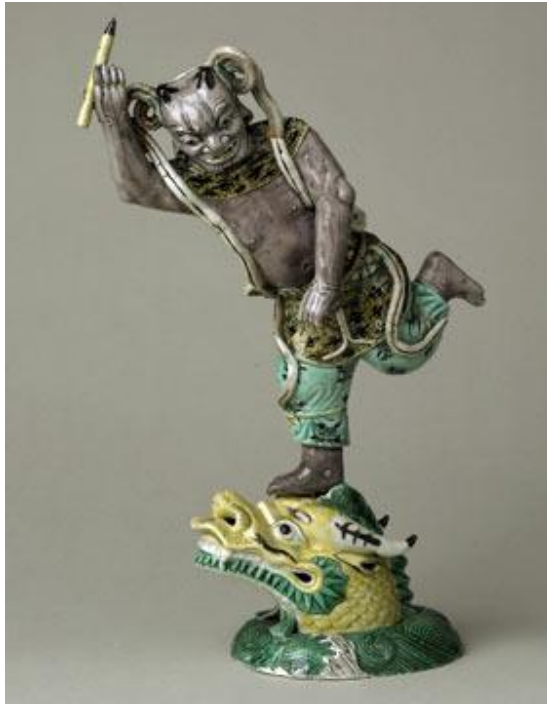
Fig.8. Figure of a Chinese Deity (LL 61).

Partridge would answer any questions about objects Lever requested; for example, about the history of a 'Chinese Deity on a dragon's head'. 30 Partridge wrote, 'This figure represents the Chinese god of literature. ... I bought it at Christie's on the 29 th July' 31 (Fig.8: LL 61). The figure of a Chinese Deity seems to offer a gloss that glitters: Partridge's explanation makes china appear a superb symbolic product. The Chinese god of literature becomes the iconic souvenir of a snobbish approach of collecting – simply an object of decoration.