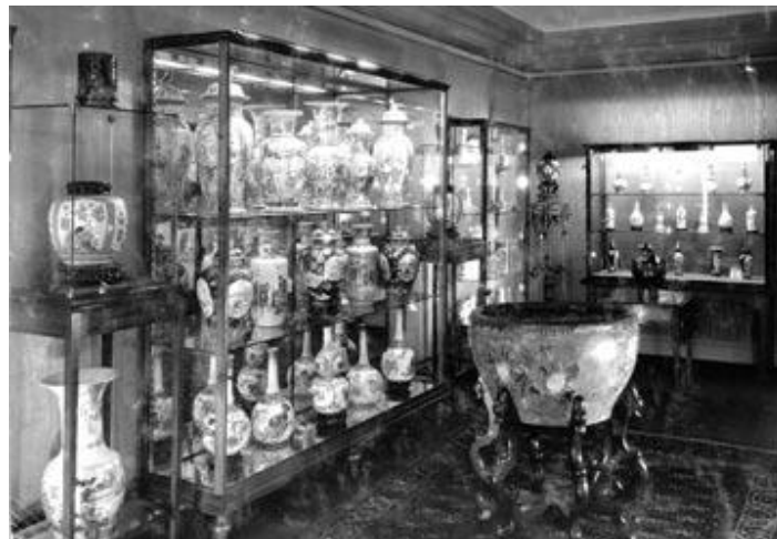
Fig.5. Interior of the 26 King Street shop. This view was taken in the 1920s.

Partridge learnt a lesson from this man who, in his 40s, was worth millions, but who had started as a grocer's assistant with nothing in his pocket. As a result of the success and expansion of the new business, Partridge was eventually able to move to 26 King Street in 1912 (Fig.4 and Fig.5).