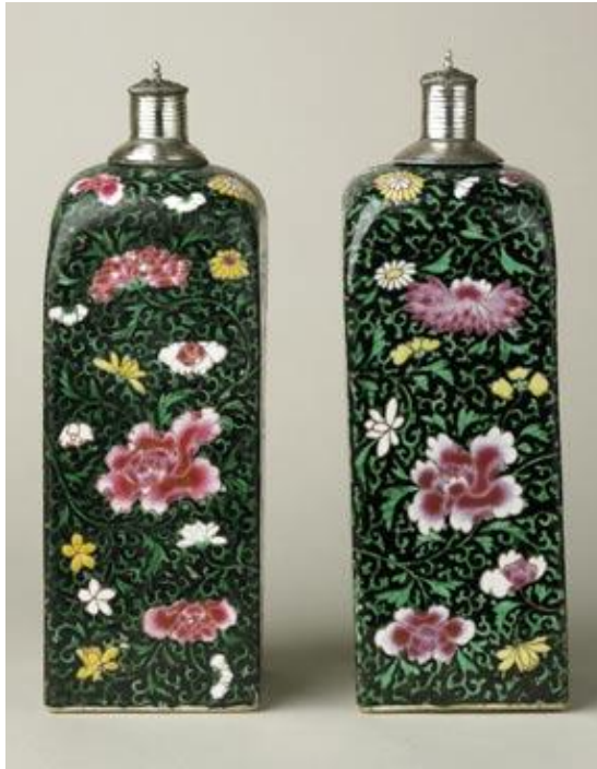
Fig.10. A pair of square bottles (LL 6735 and LL 6736).