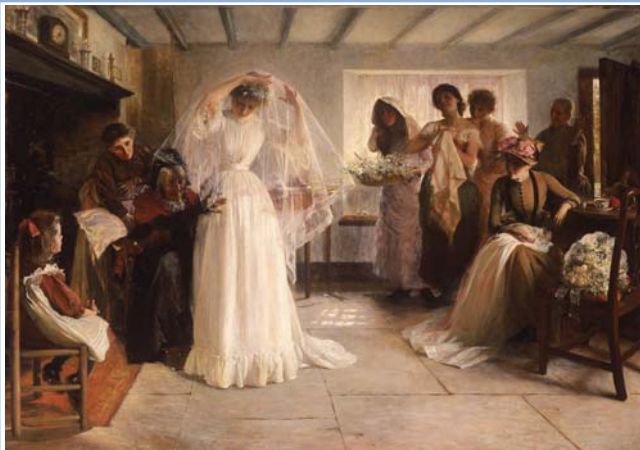
The Wedding Morning by Bacon

What are the three colours used most in this painting?