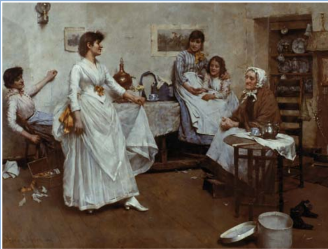
The Dress Rehearsal by Tayler

Wedding pictures were also useful as advertisements for Sunlight Soap because they showed happy family scenes as well as bright white clothes that could be laundered with Sunlight Soap.