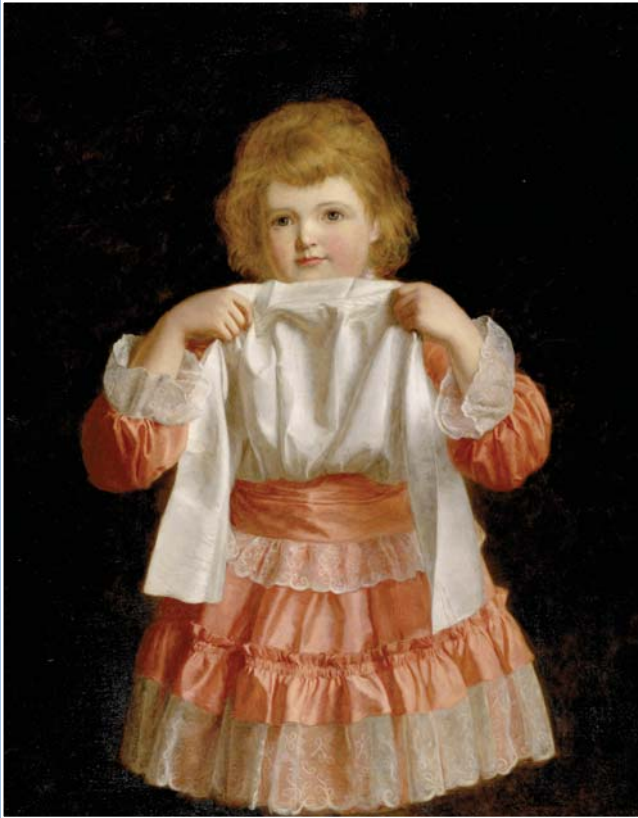
A New Frock by Frith

Lever liked to choose paintings of children to advertise his soap to show parents how clean children would be if they used Sunlight Soap!