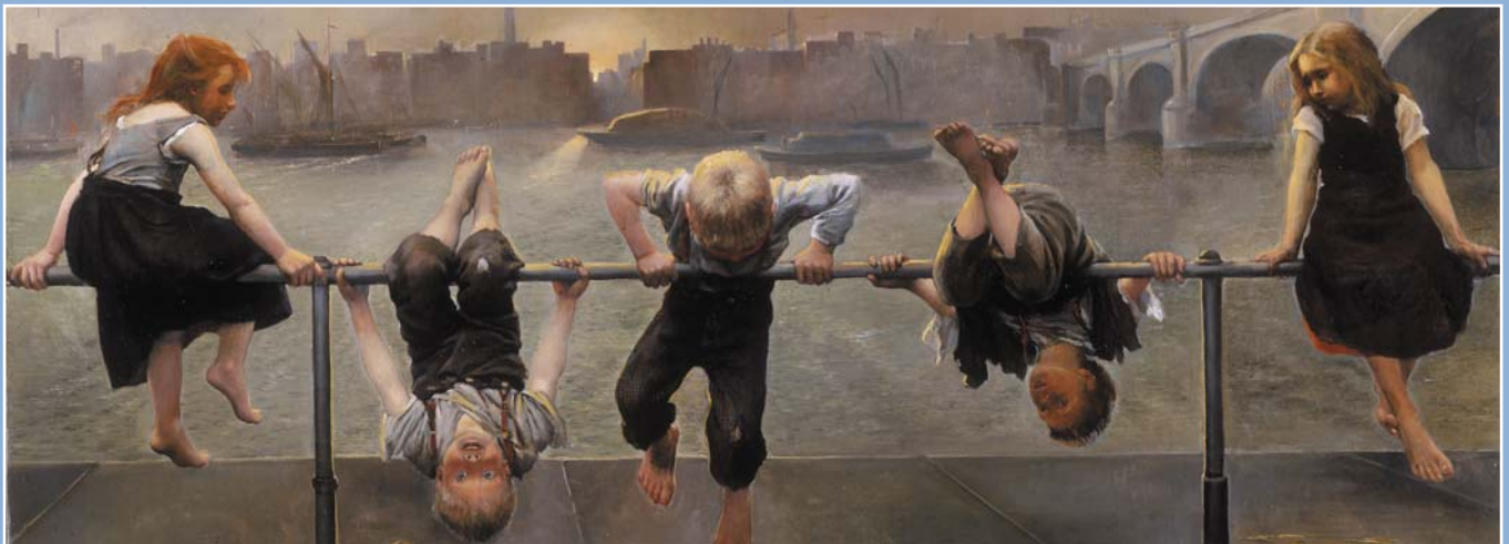
Street Arabs at Play by Tennant

This painter was unhappy when his picture was changed. How would you feel if Lever bought one of your masterpieces and changed it without asking?