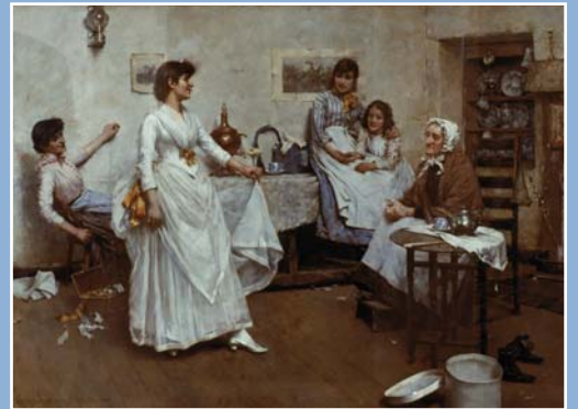
A Dress Rehearsal