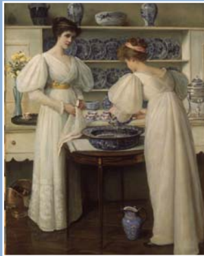
Blue and White by Jopling