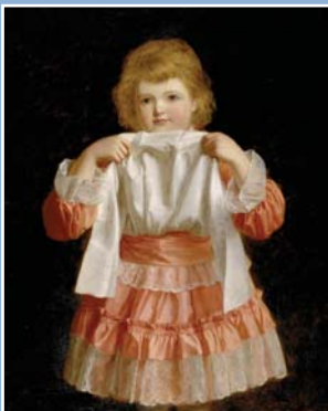
The New Frock by Frith