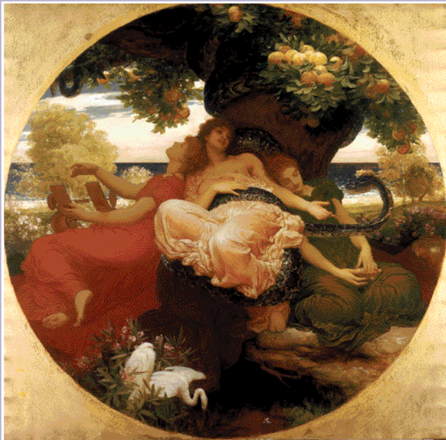
The Garden of Hesperides by Leighton

Find this painting in the gallery. The Hesperides guard the golden apples that will give eternal life to any person who eats them. A dragon also lived in the garden to help guard the apples.