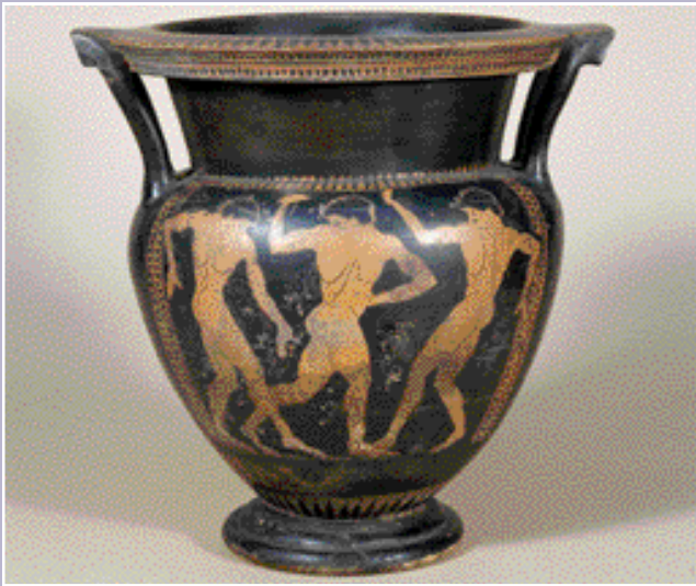
Krater, mixing bowl