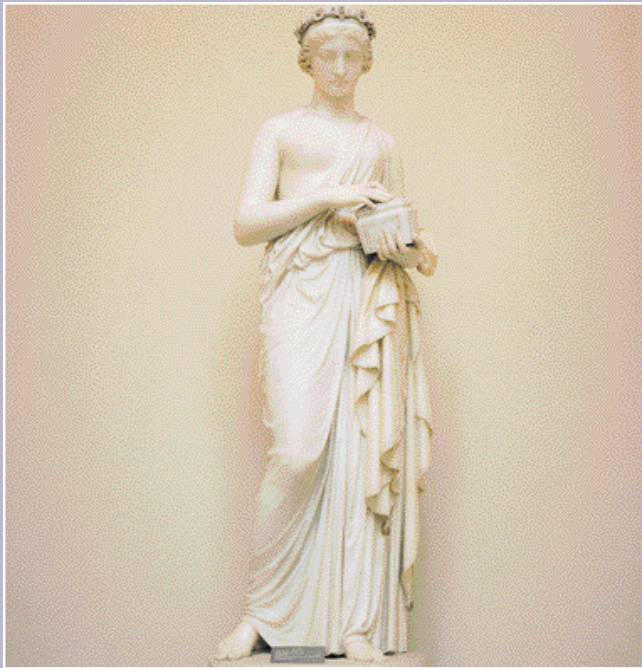
Pandora by John Gibson

Find this sculpture in the gallery. This is a sculpture of Pandora who was the first woman in Greek and Roman mythology. She was given a box by Zeus that contained all the evil and disease in the world.