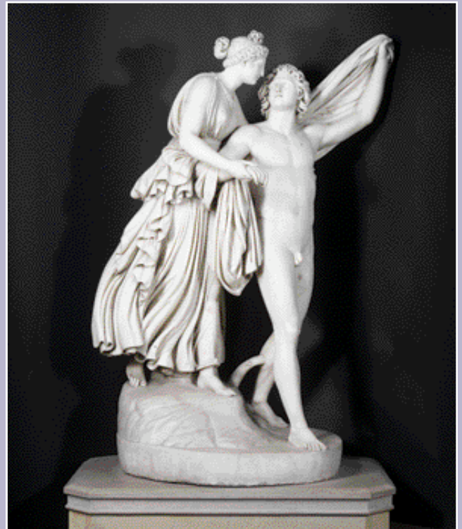
Cephalus and Aurora by John Flaxman

Pandora did open the box and after all of the evil and disease was let out, there was still “hope” left behind.