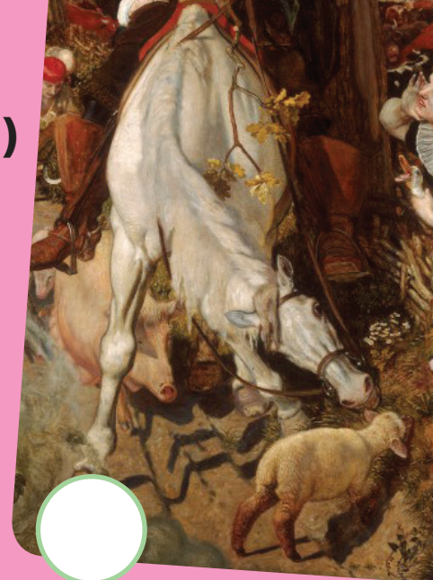
Cromwell on his Farm by Ford Madox Brown

What other animals can you see on Cromwell's farm?