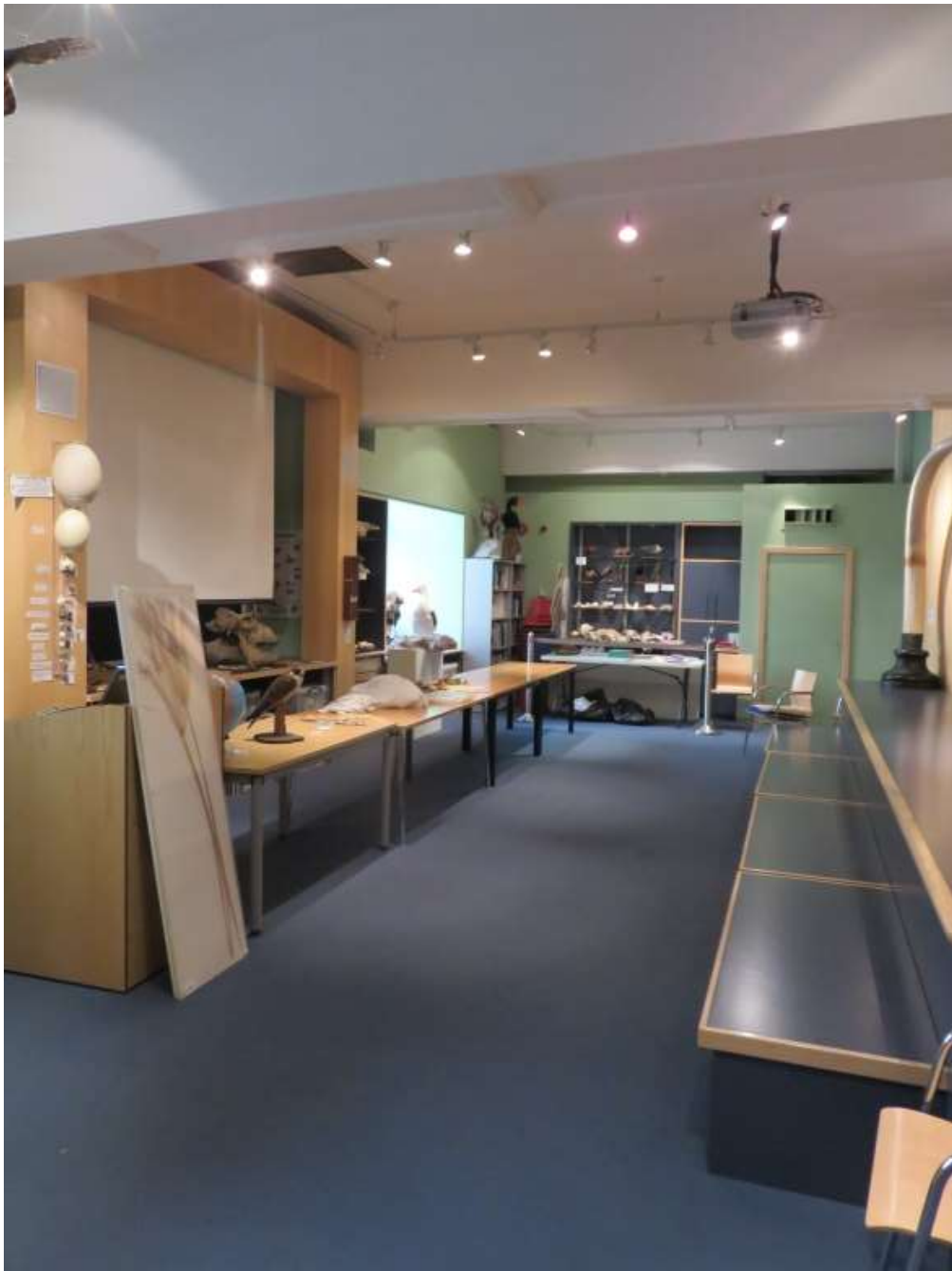
The CNHC group room is where school sessions are held.