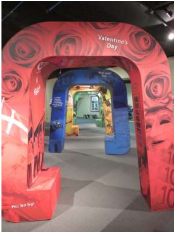
Eye For Colour 2.jpg

This is a temporary exhibition which finishes on 4th September 2016.