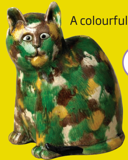
Figure of a cat

What colour is the cat's fur? What's your favourite colour?