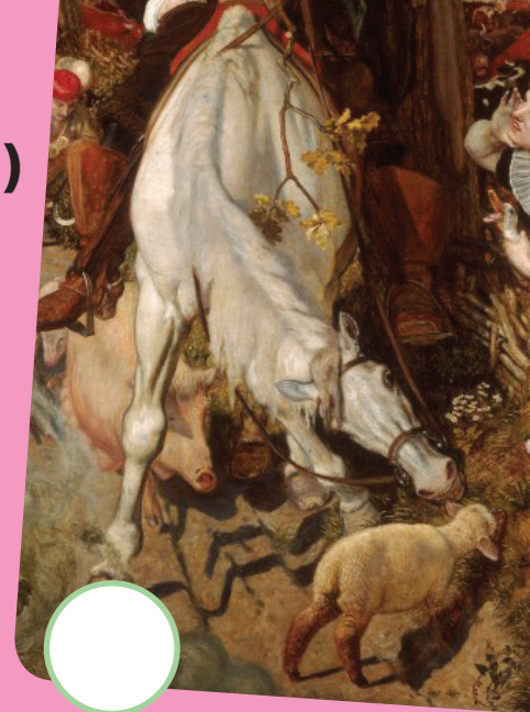
Cromwell on his Farm by Ford Madox Brown

What other animals can you see on Cromwell's farm?