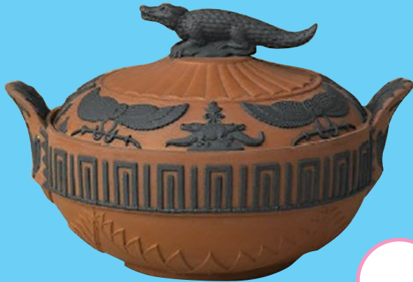
Sugar dish and cover