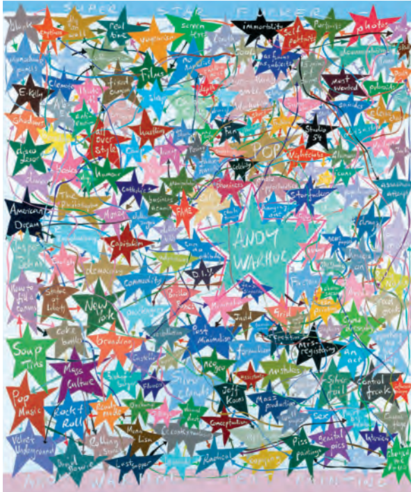
Peter Davies 'Super Star F*****', 2002

Peter Davies said "This painting was inspired by seeing the recent Andy Warhol show in Berlin and is one of a series where I have taken one key figure as a starting point and made a painting that resembles a flow chart or mind map."